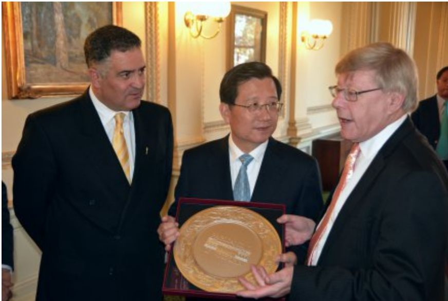
The Victorian Parliament's Presiding Officers welcomed Mr Qiang Wei and his delegation to Parliament House

Led by Mr Qiang Wei, Communist Party Secretary of Jiangxi Province and Chairman of the Standing Committee of the Jiangxi Provincial People's Congress, the delegation's interests included agriculture, mining and tourism.